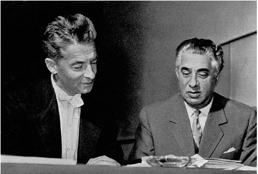
Aram Khatchaturian and Herbert Von Karajan. Vien, 1959.