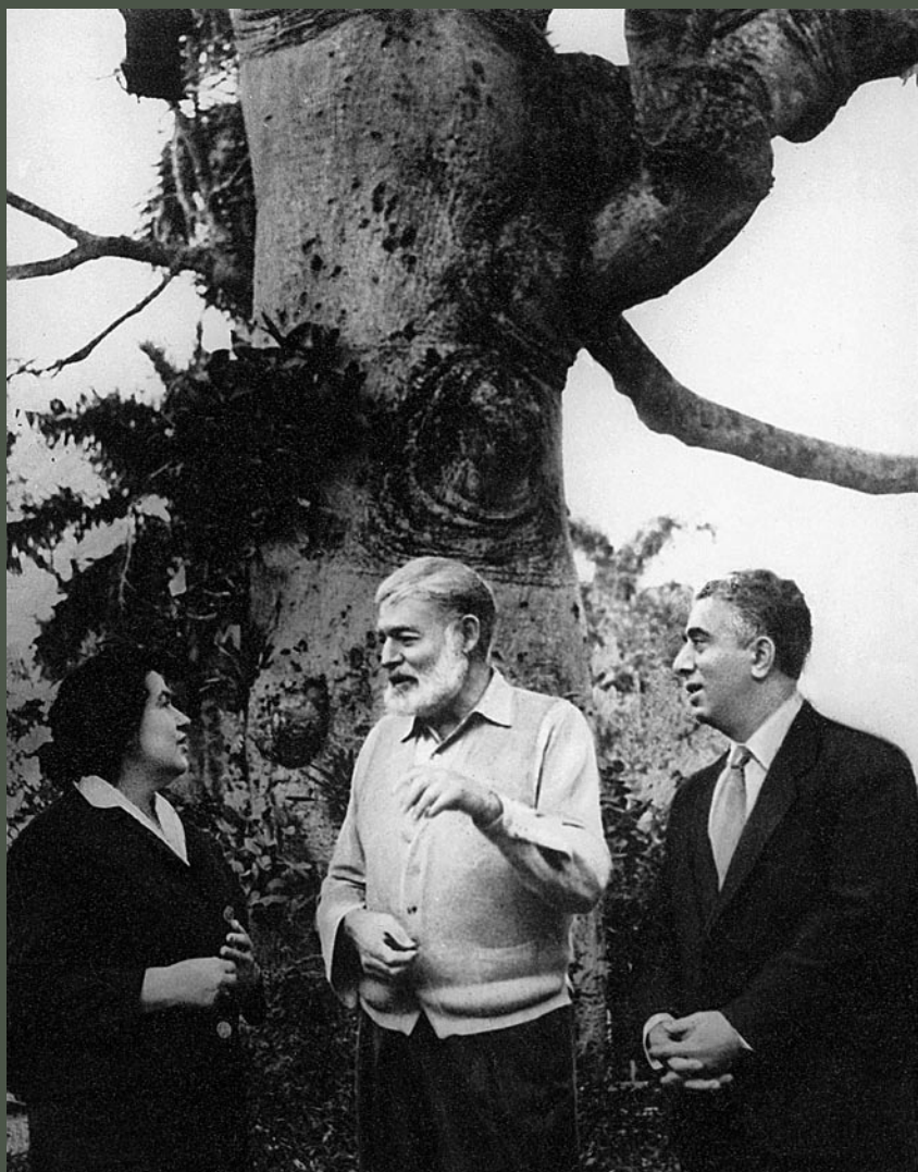
A. Khatchaturian with N. Makarova at Ernest Hemingway's house. Cuba, 1960.