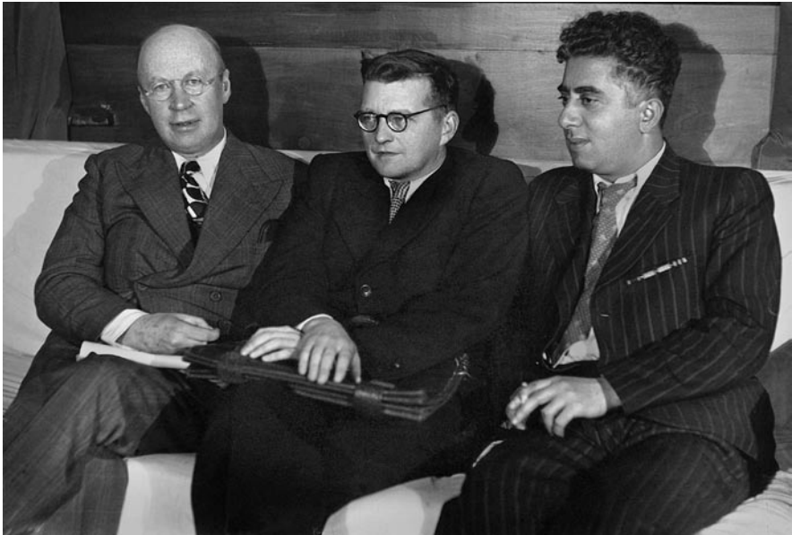
S. Prokofiev, D. Shostakovich, A. Khachaturian. Moscow, in the middle of 1940-s.